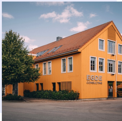
Fiskebrygga i Kristiansand